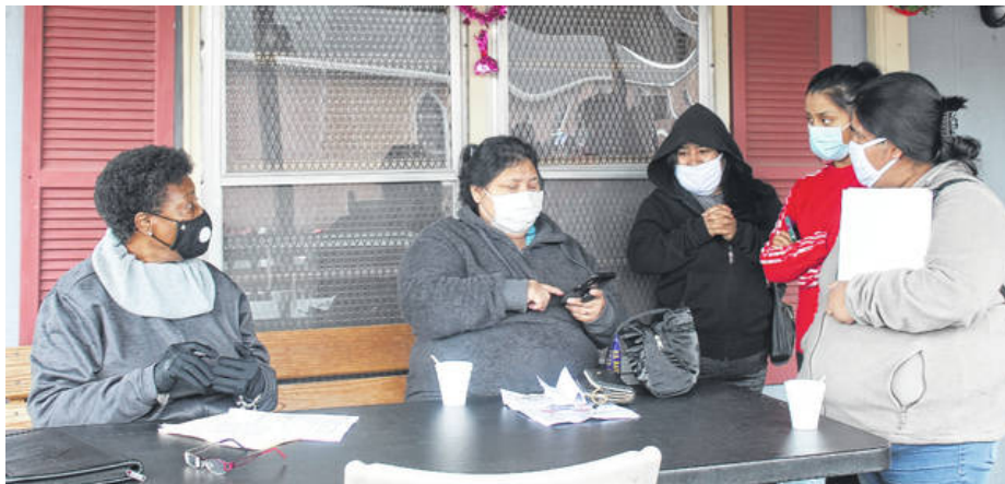
Legal Aid of North Carolina officials help residents in Sampson County.