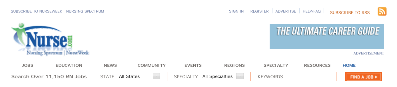
Home → New Jersey