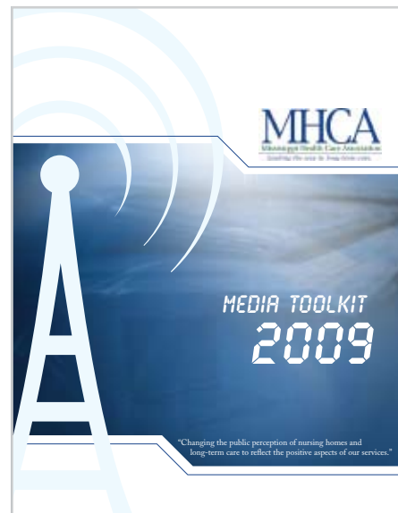
MHCA developed a Media Toolkit to help members communicate with their local media.

These lunch meetings with key leaders, on a bipartisan basis, provide the MHCA board with a relaxed, conversational atmosphere in which to discuss long-term care issues that are of current concern, and to look ahead at issues that may arise in the future. MHCA will continue these types of lunch meetings with key leaders and elected officials in 2010.