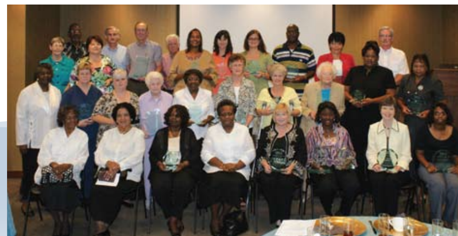
The 2009 MHCA Caregivers and Volunteers of the Year