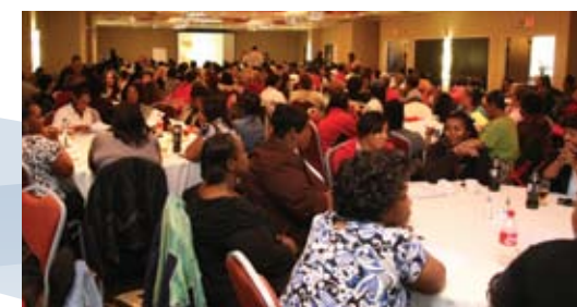
A large crowd attended the 2009 MHCA CNA Conference