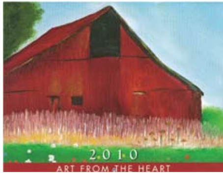
The cover of the MHCA 2010 "Art From The Heart" Calendar

The Foundation helps bridge the gap between the quality of care provided in nursing home facilities and those special emotional and physical needs not covered by insurance policies, Medicare, Medicaid, or even family members. The Foundation organizes special outings and events to fulfill lifelong dreams of nursing home residents. In addition, the Foundation also awards educational scholarships to long-term health care staff members.