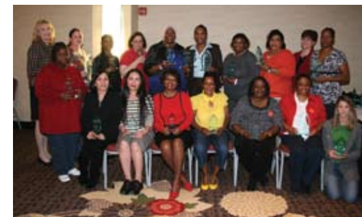
The 2009 MHCA CNAs of the Year