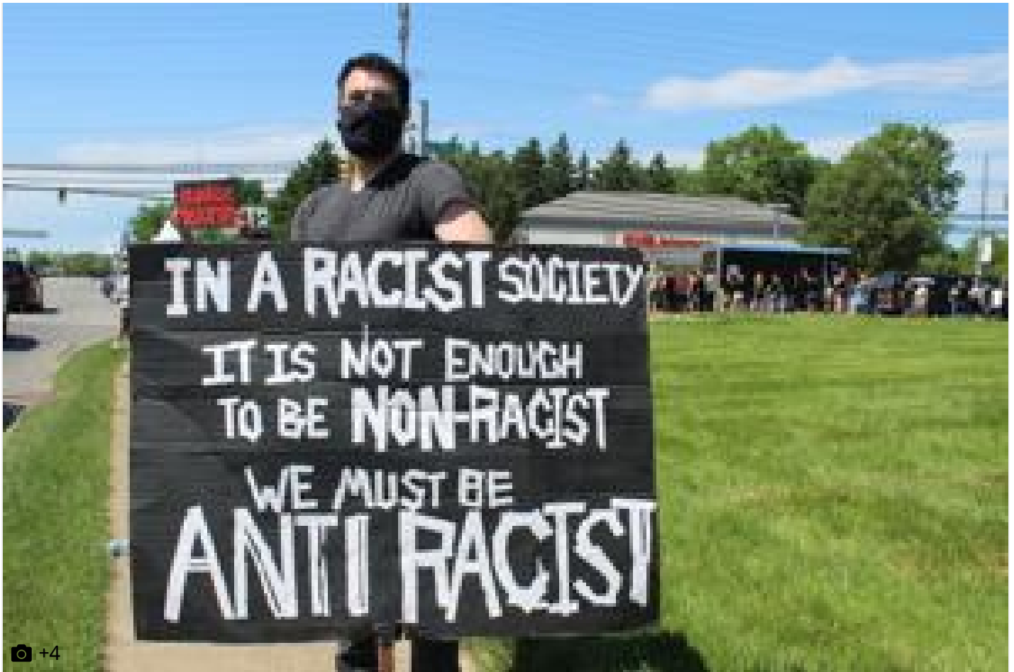
Avon: Passionate pleading, local protest brings hundreds

Avon, Avon Lake preparing to reopen playgrounds