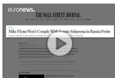
L'ex-conseiller de Donald Trump ne ...