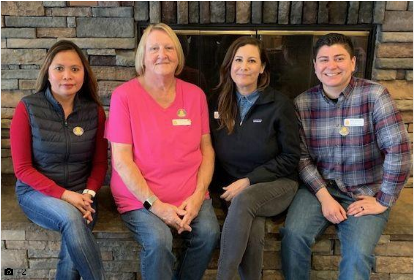
Solvang Friendship House staffers earn dementia care specialist titles