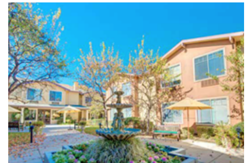
Cypress Place Senior Living