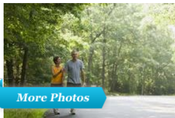
Sure, Simple Steps to Shed Pounds