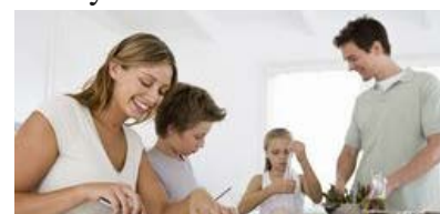
How to Control Your Cholesterol