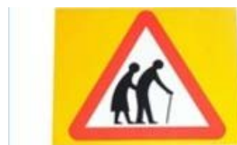
Dementia Specialist Training