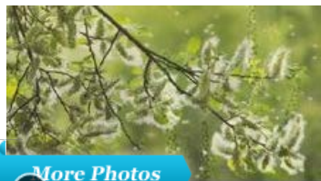
What Are Allergies and Hay Fever?