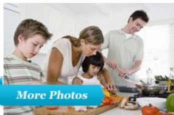
Small Substitutions to Boost Your Diet