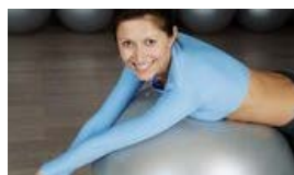
How to Cope with Aggression from Dementia