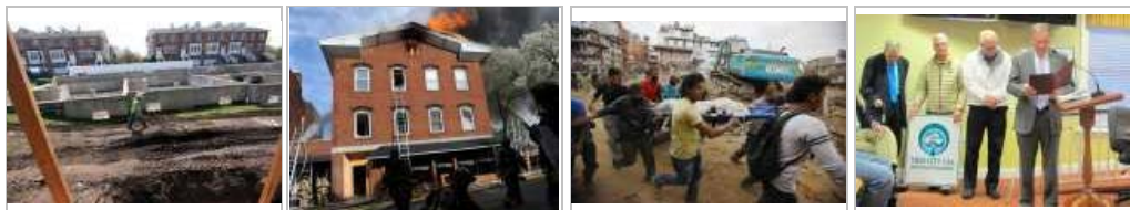
As home construction ... Hackensack three-alarm fire ... Aftershocks terrify survivors ... Verona Shade Tree Commission ...