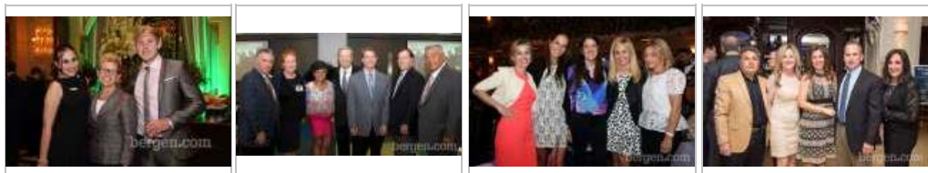
Felician College hosts 2015 ... HackensackUMC holds 2015 ... Crohn's & Colitis Foundation ... Children's Aid and Family ...