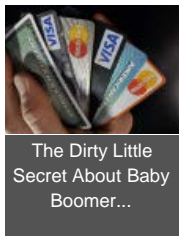
The Dirty Little Secret About Baby Boomer...