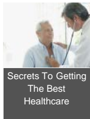
Secrets To Getting The Best Healthcare