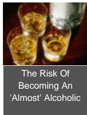
The Risk Of Becoming An 'Almost' Alcoholic