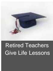
Retired Teachers Give Life Lessons