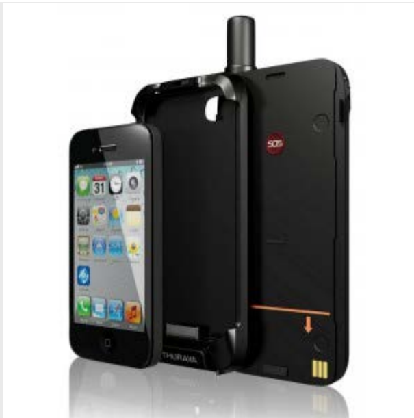
Thuraya SatSleeve iPhone 4/4S