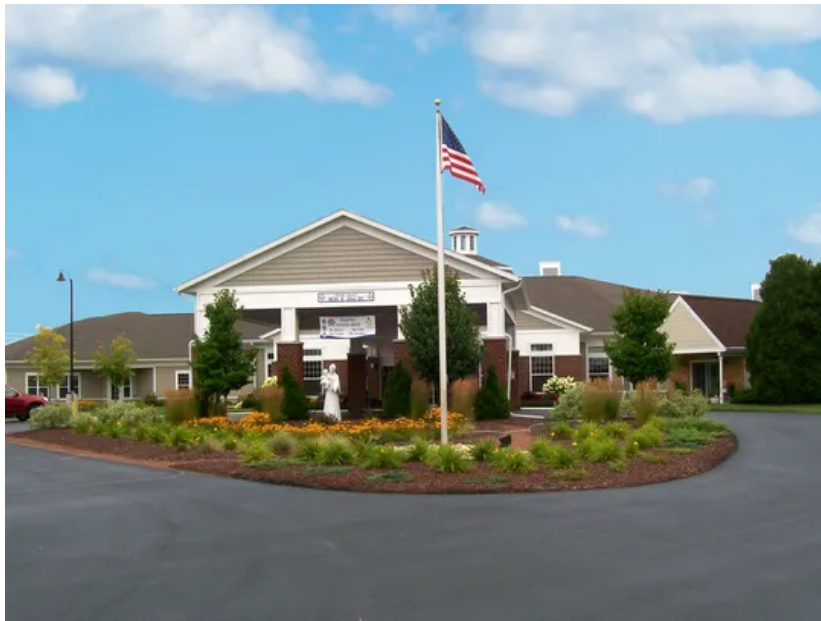
Main entrance to Felician Village in Manitowoc, pictured in 2017.