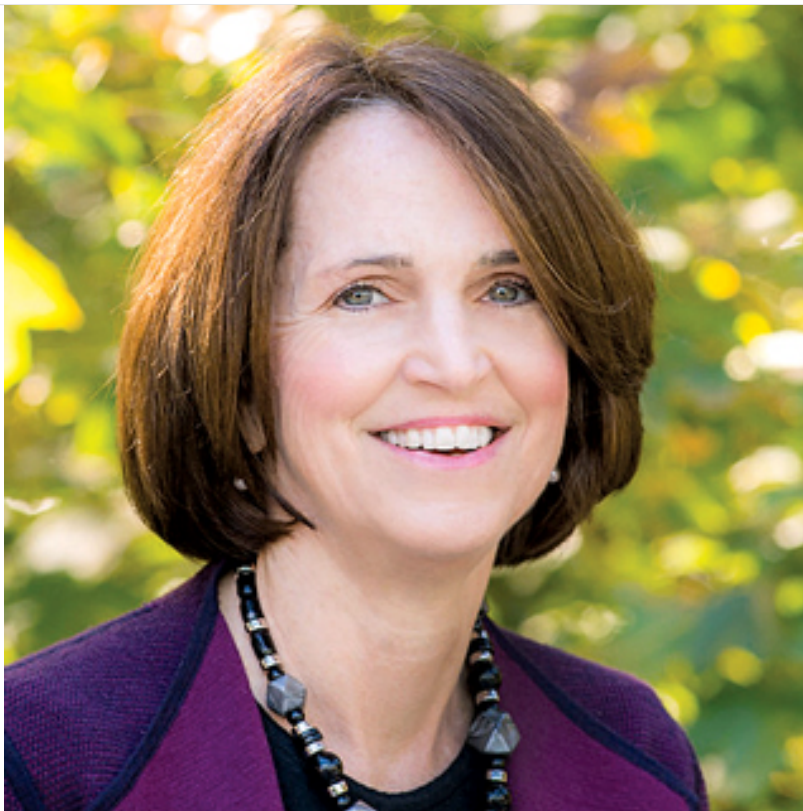
Limit on immigrant visas would hurt nursing homes, LeadingAge says - McKnight's Long Term Care News