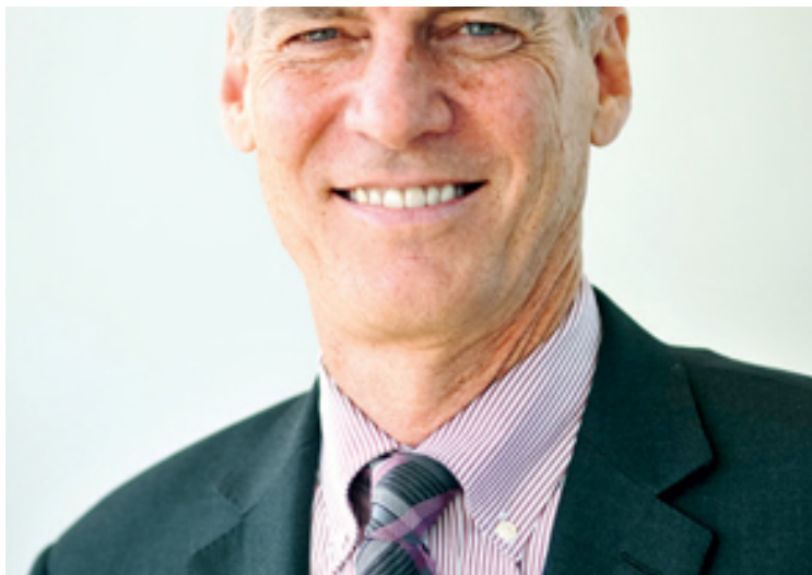
The great news about nursing homes - McKnight's Long Term Care News