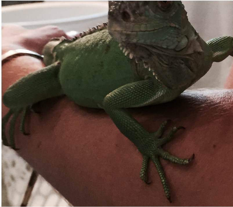
Iguana frolic winds up sending 20 nursing home residents to the hospital -