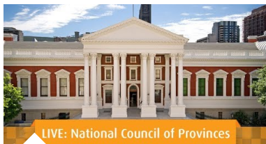
PLENARY, National Council of Provinces, 24 May 2017 Published 24 May 2017