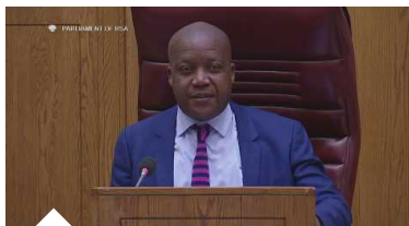
PLENARY, National Council of Provinces, 23 May 2017 Published 24 May 2017