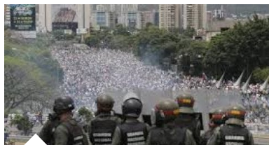
National Council BEGINS Electing Constituent Assembly Published 23 May 2017