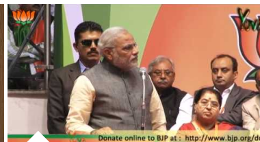
Shri Narendra Modi speech during BJP National Council Published 03 Mar 2013