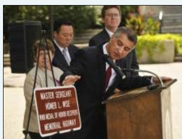
More honors for Stamford's medal of honor winner