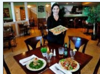
Something for most everyone at 59 Bank