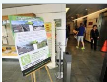
Pro-BLT signs go up in Stamford gov't center