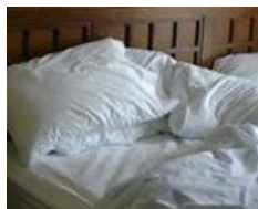
7 Surprising Reasons You Wake Up Tired Caring.com