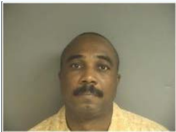
Fire contractor charged with tampering