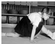
22 Things You Should Never Do Again After 50 AARP