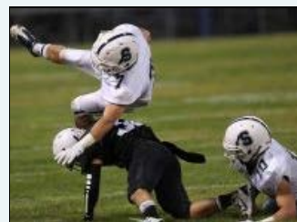
Staples rally comes up short at Xavier