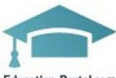
Top 3 Universities Offering Online Ph.D. Programs Education Portal