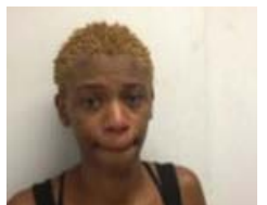
Ex-Girlfriend Accused of Attacking 8-Year-Old Boy After His Father... CafeMom