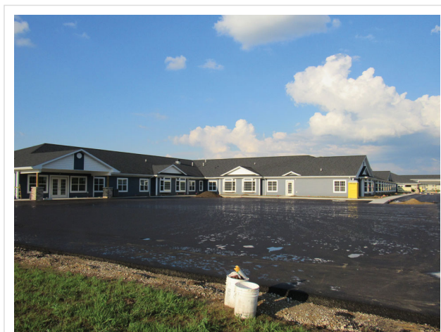
Pioneer Golden Estates on the north side of Clare is nearly complete. Everyone is invited to a Ribbon Cutting Ceremony at the complex next Thursday.