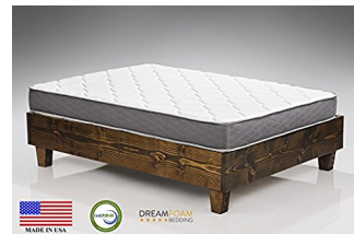
Dreamfoam Bedding Spring Dreams Queen 9-Inch ...