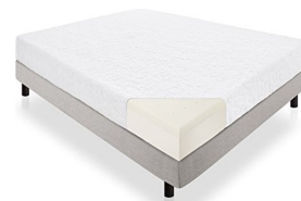
LUCID 10 Inch Latex Foam Mattress ...