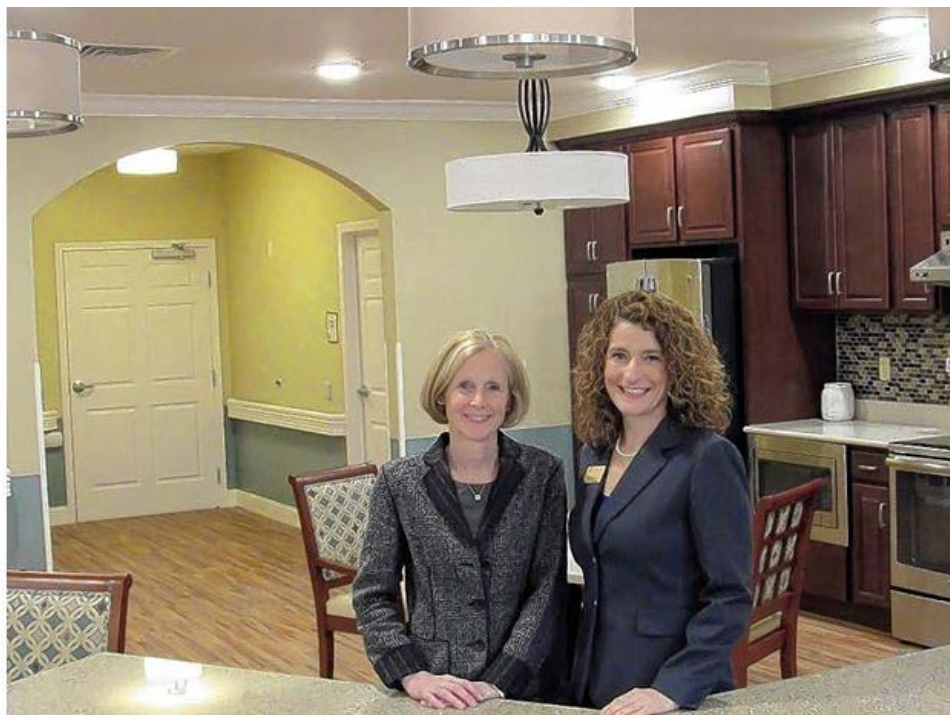
BUY THIS PHOTO

Ganzhorn Suites first of several housing complexes for seniors to open off Sawmill Parkway