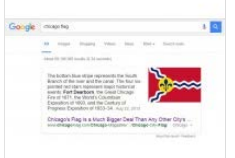
Was Chicago Flag Google Search Flub a Fluke or a Case of Trolling...