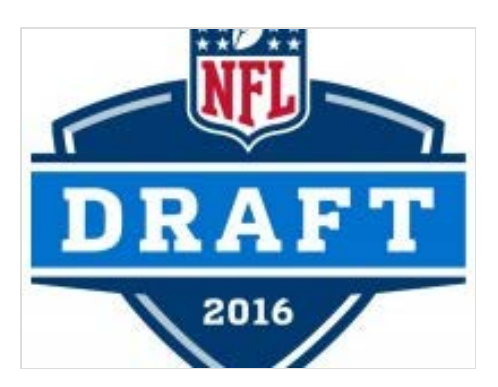
NFL Draft 2016: Live Results Tracker, Reactions and More