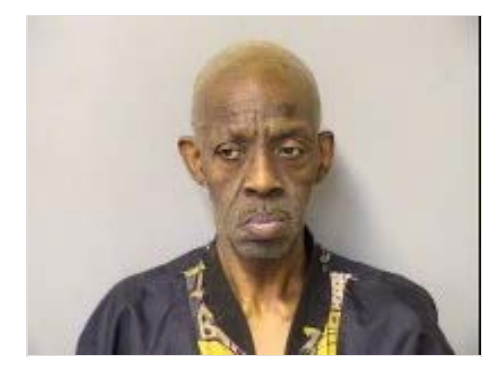
Senior Accused in Double Murder 'Disemboweled' Neighbor: Prosecutor