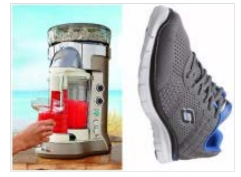
Skechers Sale, Battery Pack, Fire TV, Diamond Jewelry: Thursday's...