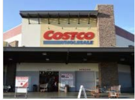
Your Costco Membership May Soon Cost More