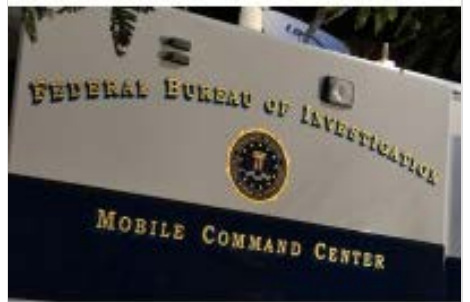
San Bernardino Shooting: 3 Arrests 'Connected to Shooter'