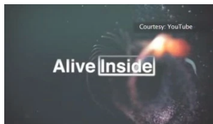
Film About Music for Dementia to Air in Stonington In "Local News"