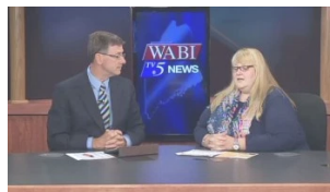
Senior Watch: Savvy Caregiver Training In "Features"