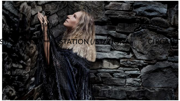
Barbra Streisand to Trump in new song: 'Don't lie to me!' (/news/entertainment/gallery/barbra-streisand-to-trump-in-new-song-dont-lie-to-me)