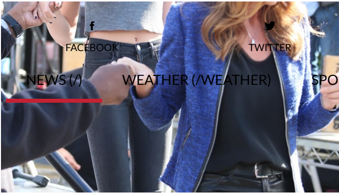
Cindy Crawford's daughter scores Daisy Marc Jacobs perfume deal (/news/entertainment/gallery/cindy-crawfordsa-daughter-scores-daisy-marc-jacobs-perfume-deal)