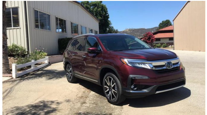
2019 Honda Pilot, Ridgeline recalled over airbag issue (/news/auto-matters/gallery/2019-honda-pilot-ridgeline-recalled-over-airbag-issue)