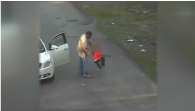
Caught on Video: Child hit 62 times in 5 minutes (/news/nation-world/gallery/caught-on-video-child-hit-62-times-in-5-minutes)