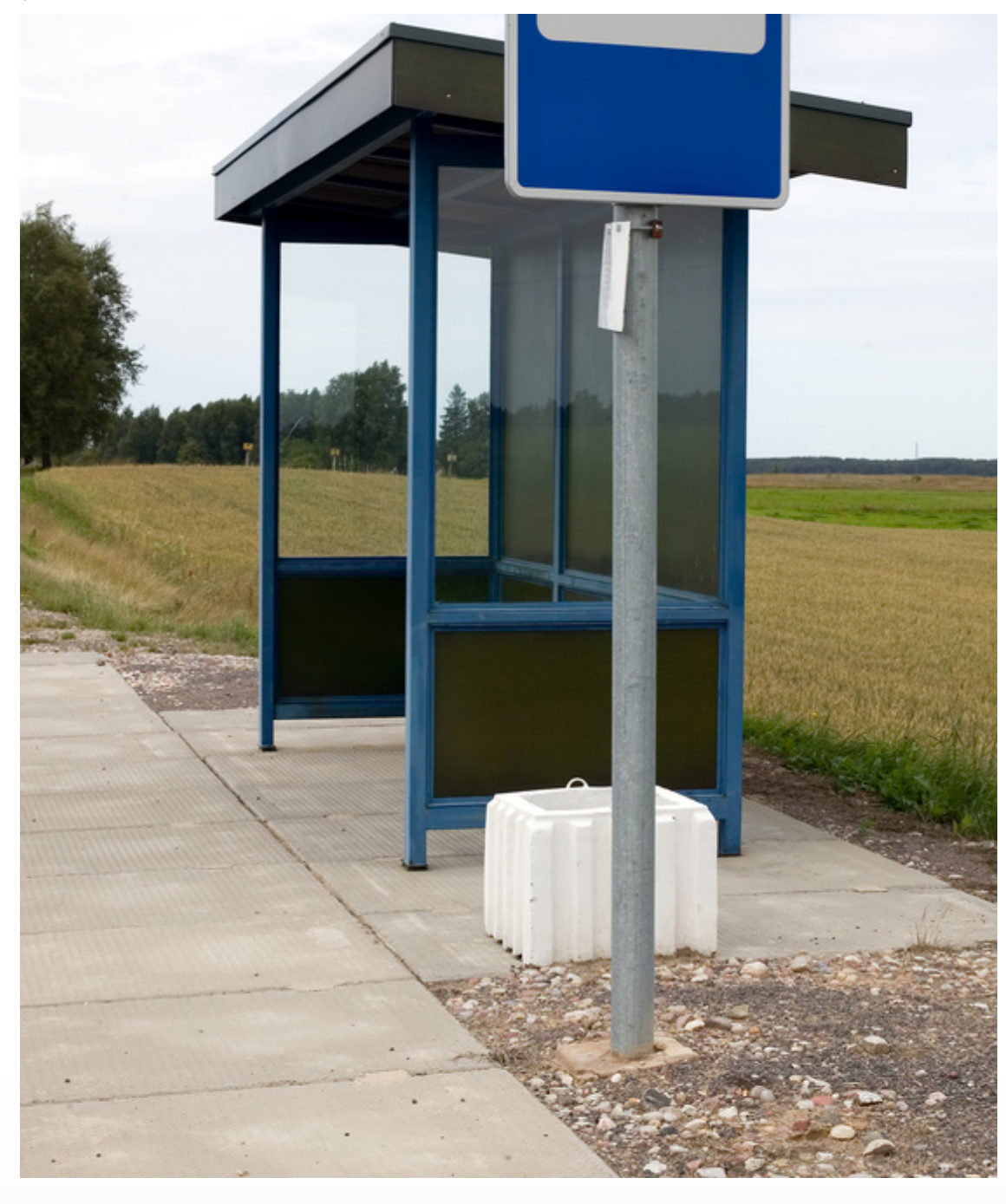
looking at this website www.nccdp.org for The National Council of Certified Dementia Practitioners. It's a great resource for all things dementia-related. As I'm browsing around, this link catches my eye: Fake Bus Stop Keeps Alzheimer's Patients from Wandering Off