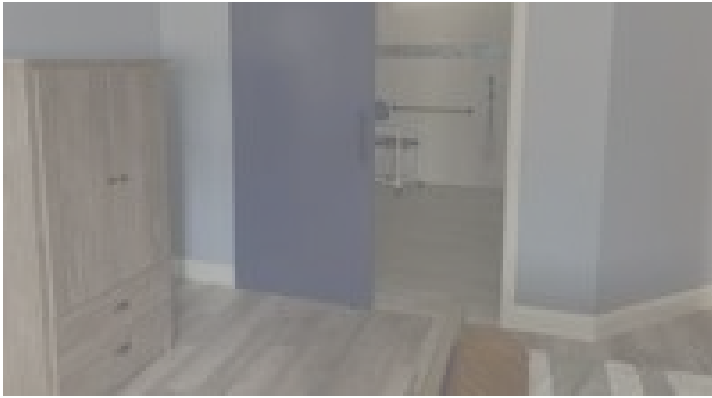
Family Connect Memory Care home, located at 659 Chalk Hill Road in Solvang, was established to provide quality care to individuals living with dementia, Alzheimer's, Parkinson's or other cognitive decline.