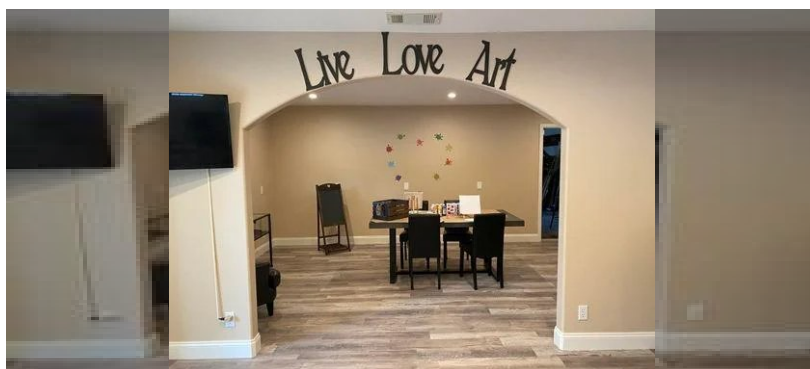
Family Connect Memory Care opens its newest location in Solvang.