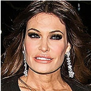
The Tragedy Of Kimberly Guilfoyle