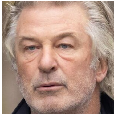
Sheriff Confirms What We All Suspected About Rust Shooting